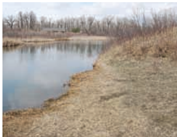
A natural riparian area.

The MD of Foothills has begun work on a riparian areas protection tool, the Riparian Setback Matrix Model (RSMM). In consultation with Aquality Environmental Consulting Ltd. a multi-disciplinary firm based out of Edmonton, the MD has taken the initial steps to prepare the RSMM for use in the Foothills region. The goal of developing the tool and accompanying educational materials is to ensure the preservation, protection, and enhancement of riparian areas and aquatic resources in the MD of Foothills.