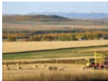
Regina Sacheli, Honourable Mention