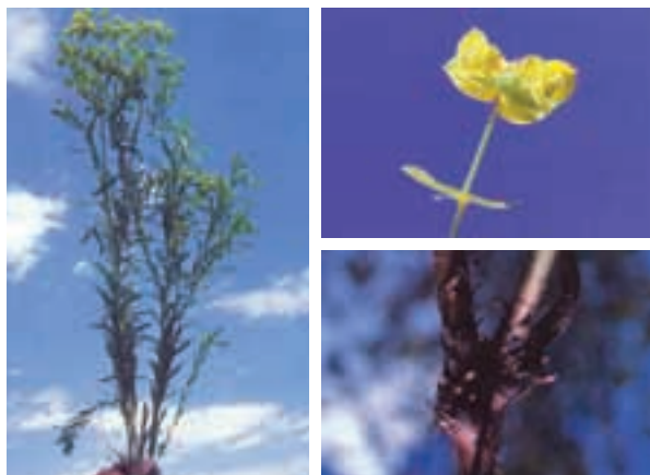
Leafy Spurge, L: plant TR: flower, BR: buds on root