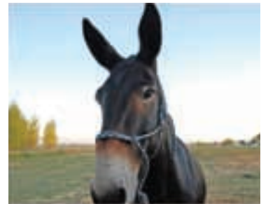
Tycen Allan, Honourable Mention