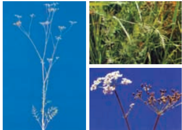
Wild Caraway, L: plant TR: leaves, BR: flower

During the course of weed spraying in the Municipal right-of-ways, the MD will be using a mixture of a Dow Agro product called Milestone mixed with 2-4-D. Another Dow Agro product we will be using will be that or Tordon 22K for specific weeds. This product will only be used in a spot treatment application.