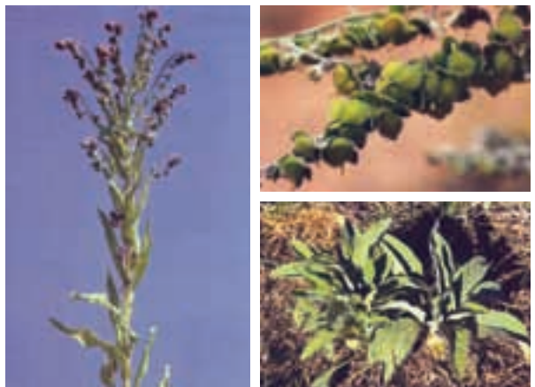
Houndstongue, L: plant TR: flower seed, BR: rosettes