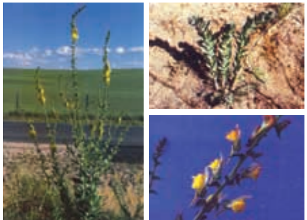
Dalmation Toadflax, L: plant TR: leaves, BR: flower